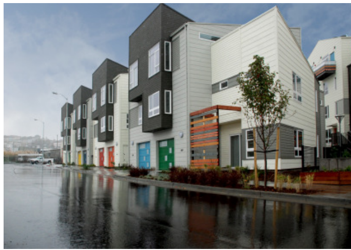
TYPICAL 4 BEDROOM UNIT