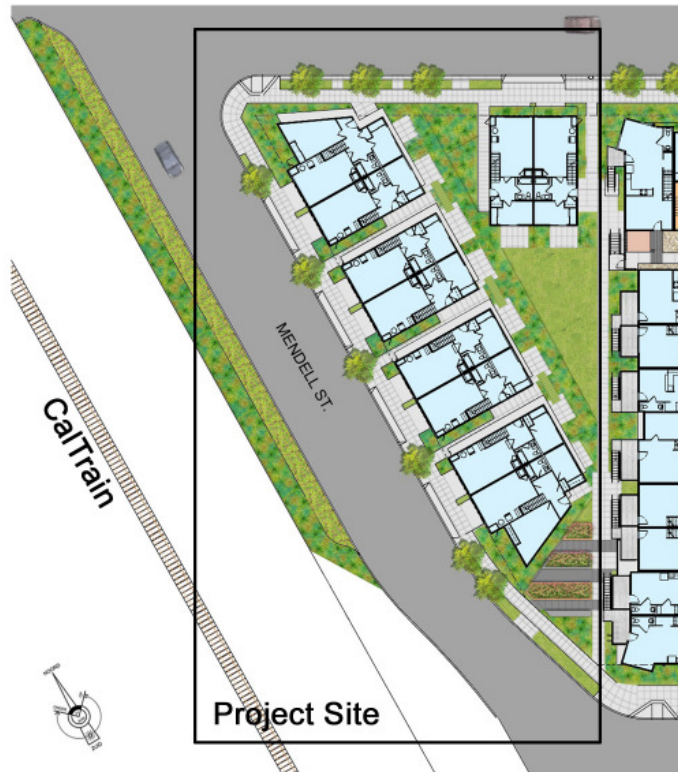
OVERALL SITE PLAN

Project Armstrong Place Multifamily - Duplex Townhomes, Affordable San Francisco, CA